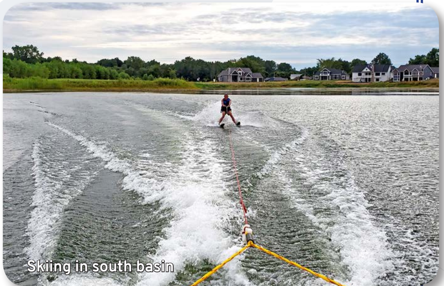
Skiing in south basin